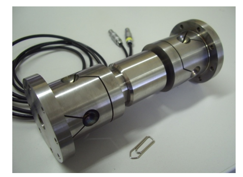
Figure 1: Actuator with two prototype hinges.

inclined actuator pairs in the same plane. The "roll" or rotation around the longitudinal axis is not suitable and should hence also be blocked by the guidance.